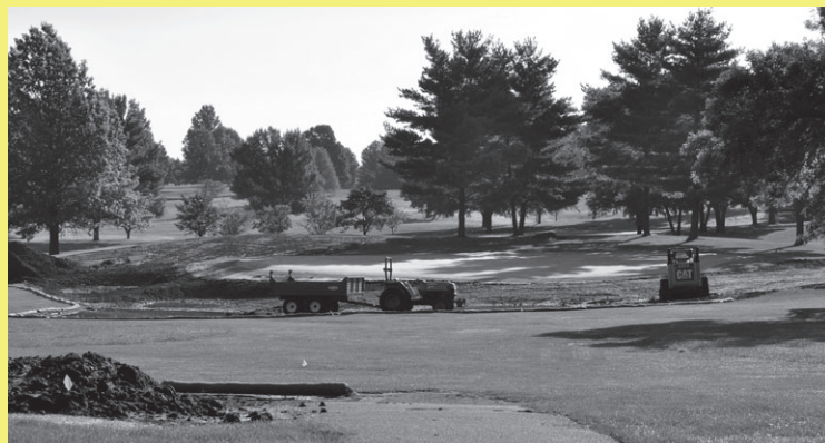
Kellogg 18 #17 green under construction. 8-9-11

Color photos of the construction process are at www.peoriaparks.org/golf and in the Kellogg pro shop. Have specific questions on the construction process? E-mail golf@peoriaparks.org and we'll get you an answer.