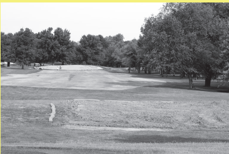
Kellogg 18 #9 new forward tee. 8-16-11