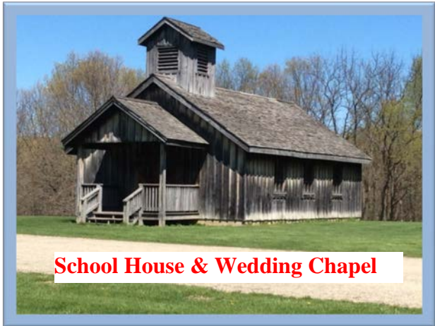
School House & Wedding Chapel