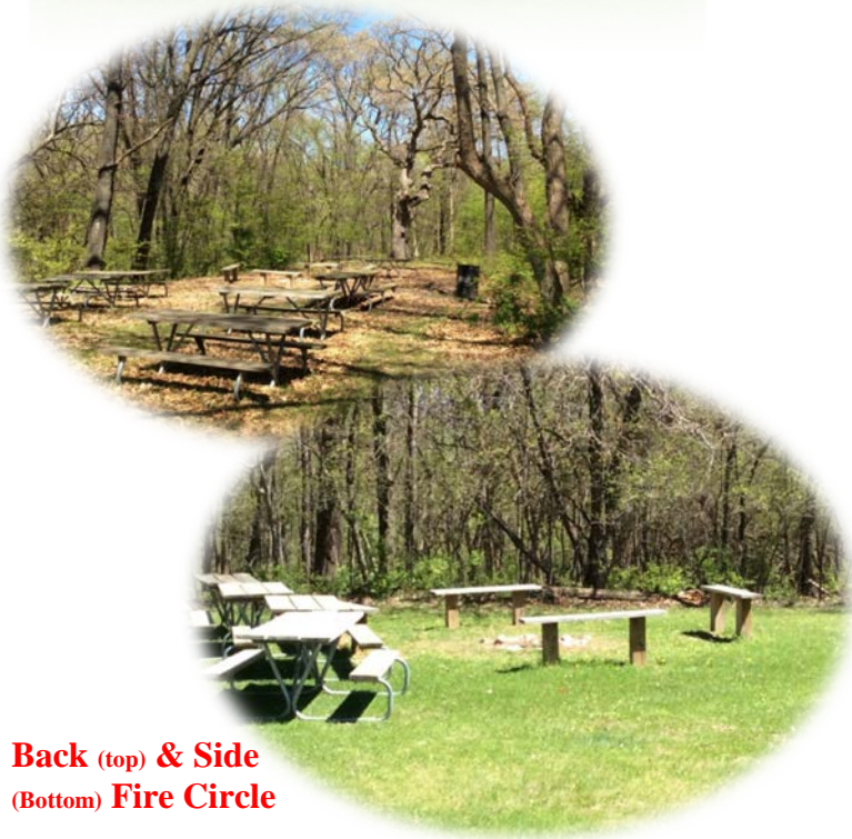
Back (top) & Side (Bottom) Fire Circle