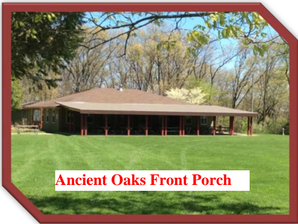
Ancient Oaks Front Porch